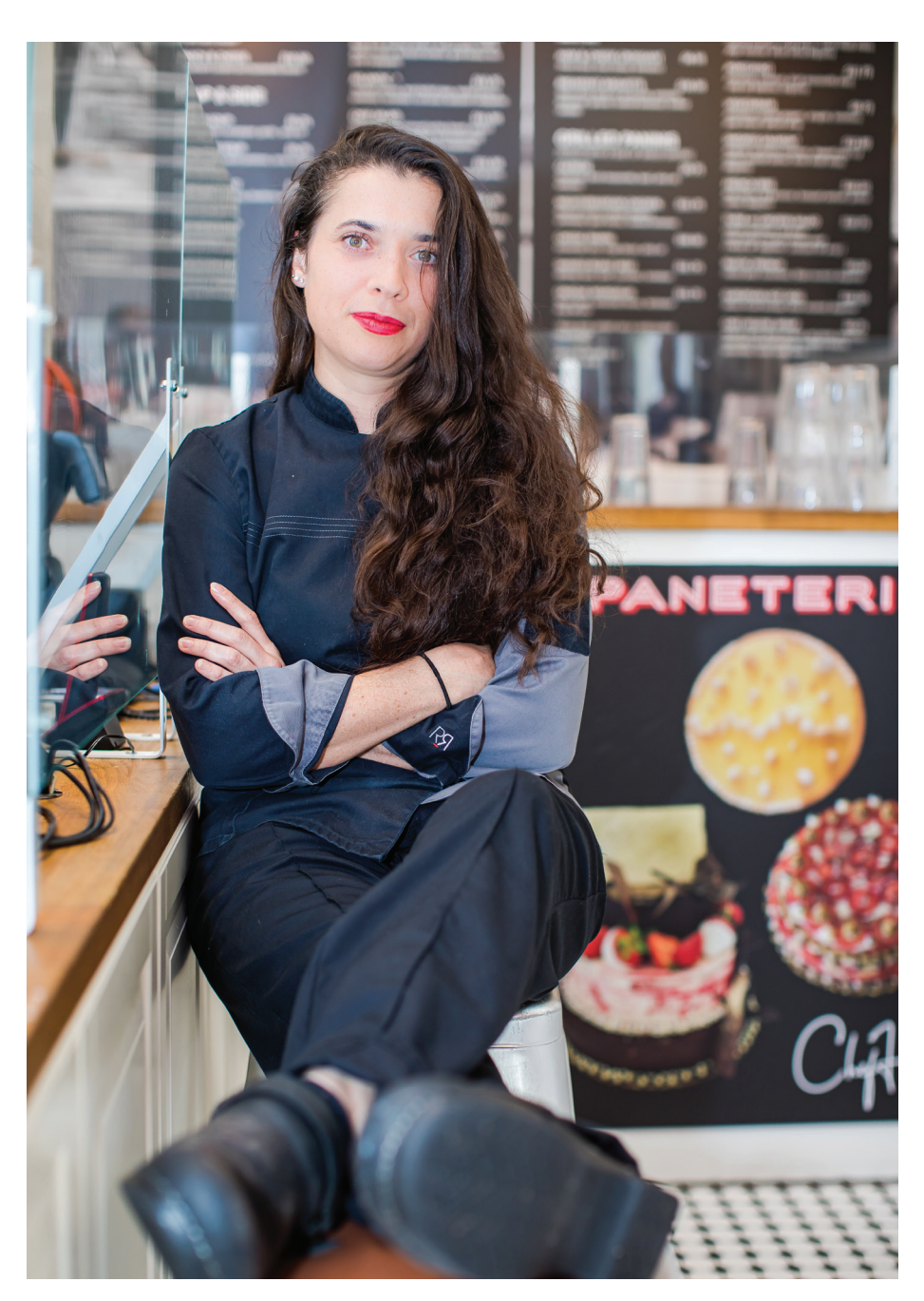
Paneterie is a quaint family-owned and operated bistro-style bakery serving traditional artisan-crafted French bake goods, sandwiches, salads, and delicious coffees and drinks.

Bakery is where she has been creating her intricately constructed desserts, and because of her culinary skills, performance, and creativity, the shop has never been hotter.